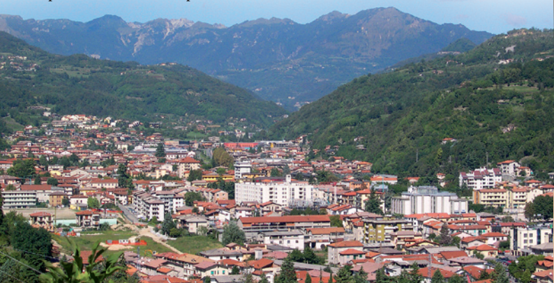
A panoramic view of Chiampo

www.santuariochiampo.com fratichiampo@libero.it