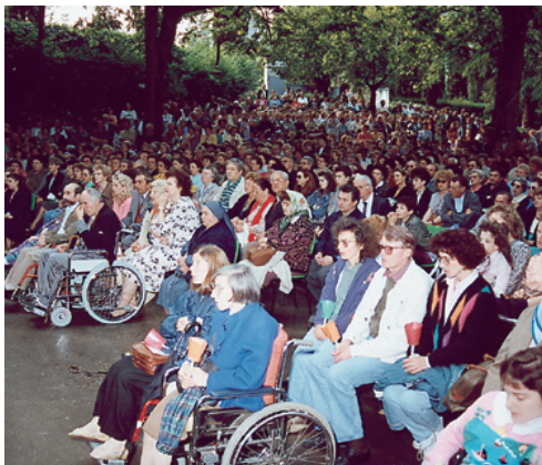
Pilgrims worship at the Grotto

The Grotto of Lourdes is the centre of the religious movement in Chiampo.