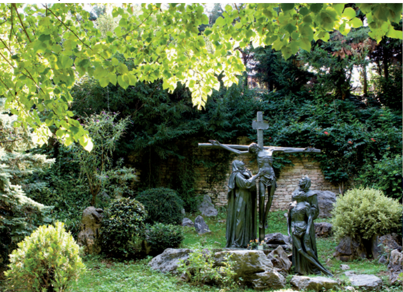
The Calvary scene