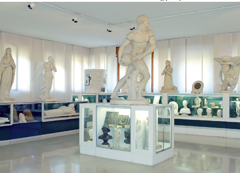
The gypsoteque of Blessed Claudio

materials from many nationalities, which have been donated by missionary Friars from Veneto); FIGURATIVE ARTS (a collection of 125 works, both paintings and modern sculptures, which were donated by the UCAI, in honour of Blessed Claudio, sculptor of marble).