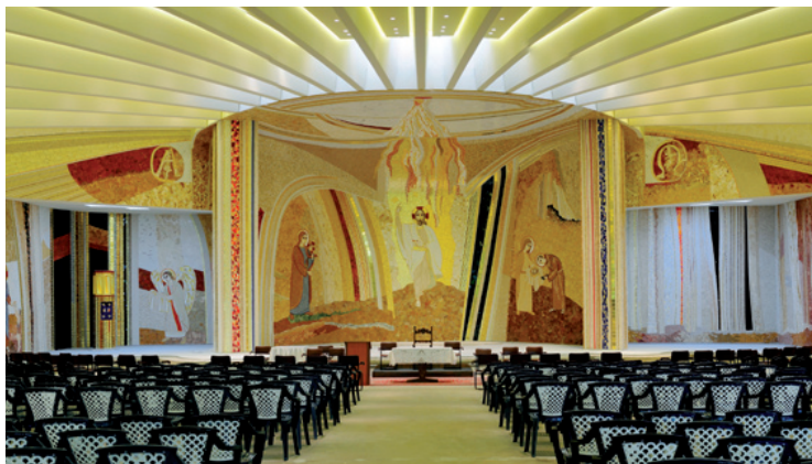
The interior of the Church of Blessed Claudio

To accomodate the ever increasing number of pilgrims, in 2001 work began on the construction of the new church to Blessed Claudio . Taking inspiration from the fossils and shells found in the valley, the Franciscan architect Fr. Angelo Polesello and the engineer Ferruccio Zecchin designed and created a shell-shaped construction on two levels: the crypt with chapels and rooms, and the assembly hall for liturgical celebrations.