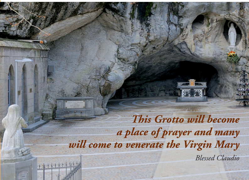
The Grotto of Lourdes

This Grotto will become a place of prayer and many will come to venerate the Virgin Mary