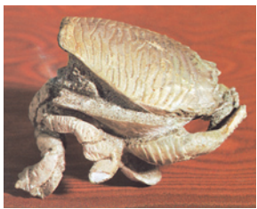
Museum, Fossils sec., “Ranina”

Inaugurated in 1972 by its passionate founder, Fr. Aurelio Menin, this rich cultural heritage is divided into 11 sections: MUSICAL INSTRUMENTS (an interesting collection of musical instruments from various parts of the world); MINERALOGY (a splendid collection of minerals, both Italian and foreign); ZOOLOGY (a collection of 1,500 embalmed animals from various parts of the world); APPLIED GEOLOGY (a unique collection of the 74 types of marble to be found in the Chiampo valley); PHOTOGRAPHIC HERBARIUM OF THE CHIAMPO VALLEY (a splendid photographic collection of 50 “medicinal plants” indigenous to the Chiampo valley); THE GYPSOTEQUE OF BLESSED CLAUDIO (a collection of original plaster casts of the sculptures of Blessed Claudio. His prayer books and work tools are also on display); CONCHOLOGY (a collection of marine shells from various parts of the world); PALEONTOLOGY (a large collection of fossils from the Chiampo valley); PALETHNOLOGY (work tools and objects from the ancient inhabitants of the Chiampo valley); ETHNOLOGY (a rich varied collection of