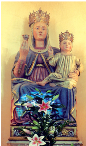
The Madonna (15th century)

La Pieve was an old rural chapel which dated back to the 10th century, and was the centre of evangelization of the Chiampo valley. It was destroyed in 1240 but was immediately rebuilt and enlarged.