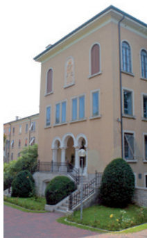
The Junior High School